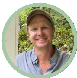
Marshall Bartlett Home Place Pastures